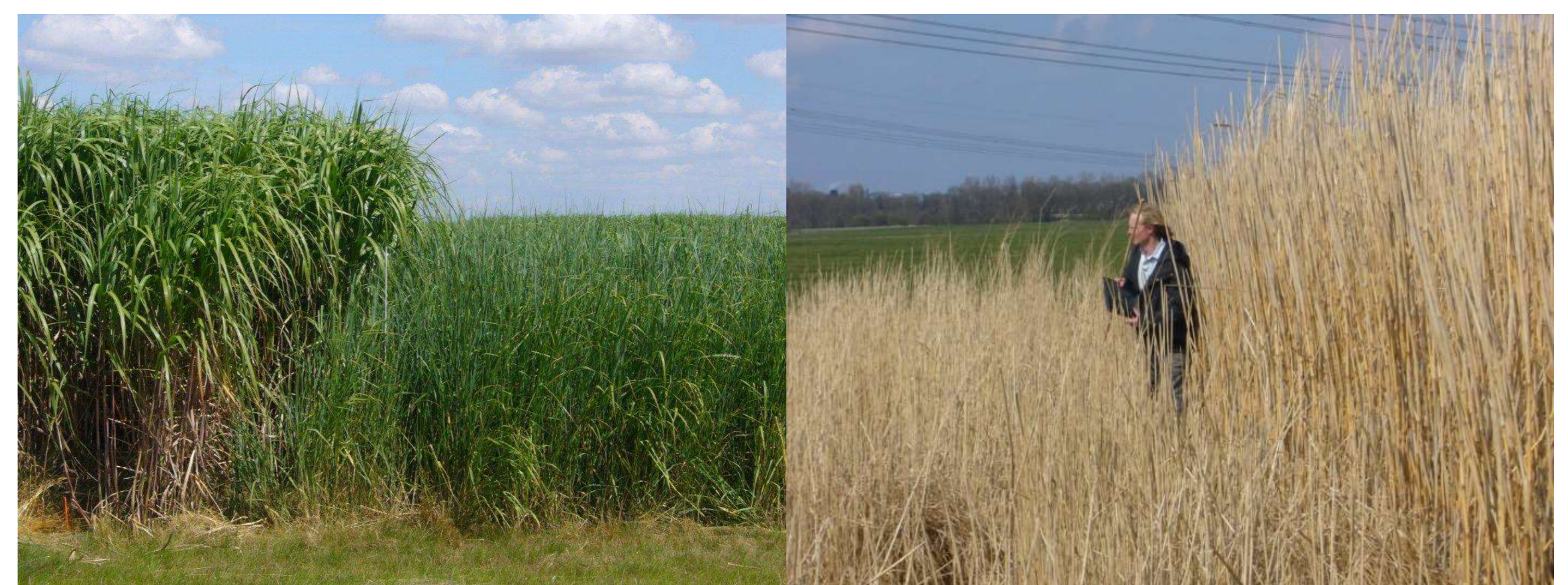
Figure 3. Miscanthus and switchgrass grown side by side in summer and winter (just before harvest) showing the difference in length and growth habit.